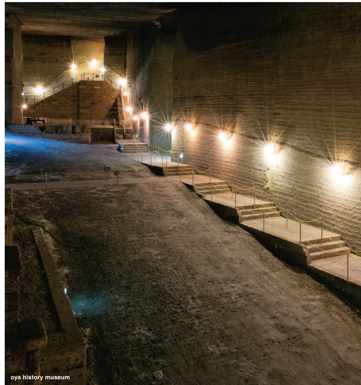
oya history museum